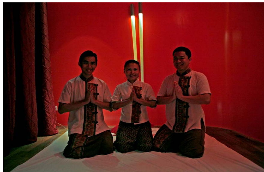
Price of package per person in double occupancy, EUR:

Special offer : 15% discount on package price for stays between Sunday and Thursday during the season A